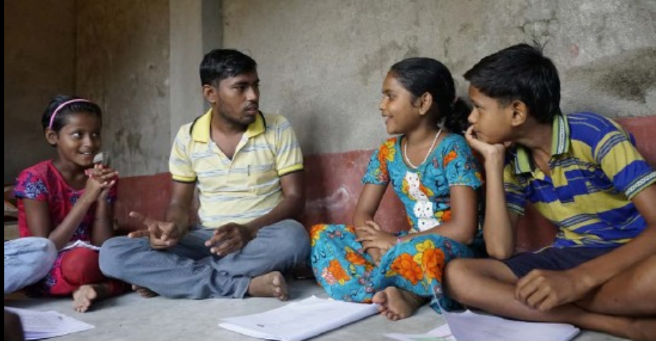
One People in One Global Homeland (continued)