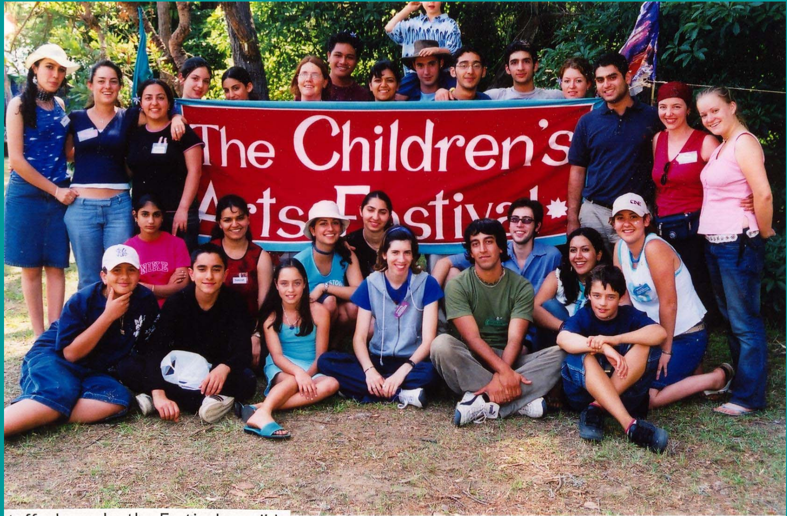
staff who make the Festival possible